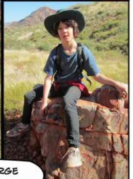
2011 ORMISTON GORGE CLASS 4/5 CAMP.